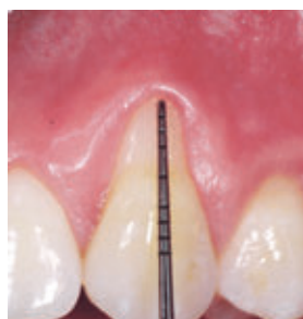
Before treatment with Straumann® Emdogain®