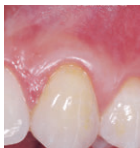
8 months after treatment with Straumann® Emdogain®