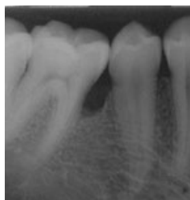
Before treatment with Straumann® Emdogain®